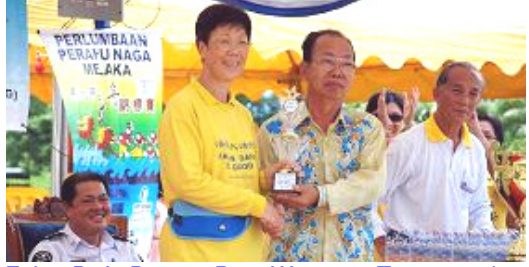
Falun Dafa Dragon Boat Women's Team receives an award